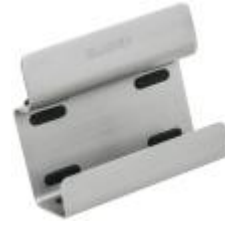
Stainless Steel Magnetic Caddy, for Stainless Steel sinks 230694